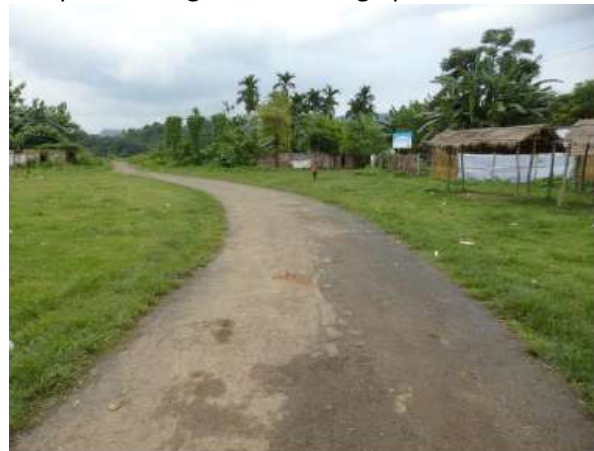
Connecting road to bridge