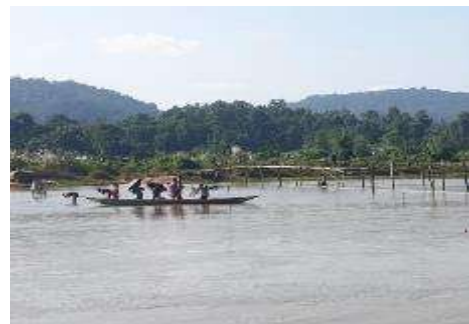
Figure 2: People commuting through boat

w ith the operation of the proposed bridge it is anticipated that villagers will no more