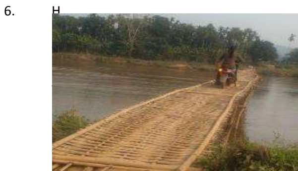
Figure 1: Current foot-bridge