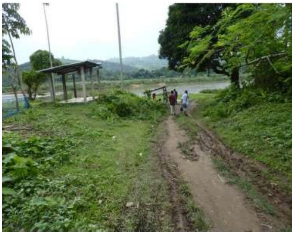
Approach to bridge from Thapa Bazaar side