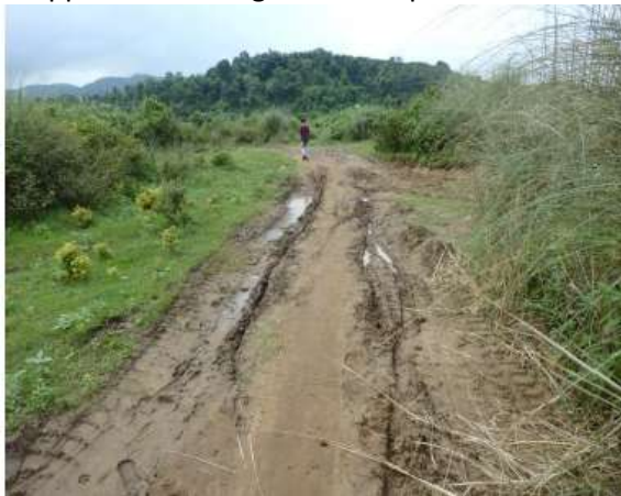
Approach to bridge from Chidaret side