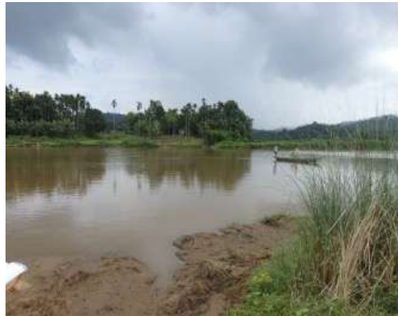
Proposed Bridge site showing operation of boat