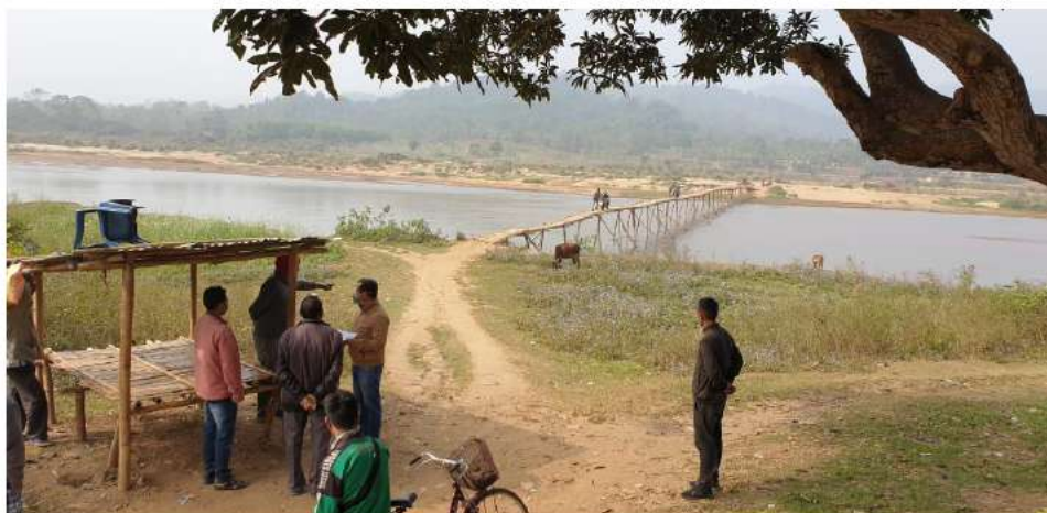
PHOTOGRAPHS TAKEN DURING THE INTERVIEW WITH THE BOAT MAN/OPERATOR ON 21 st JANUARY 2021